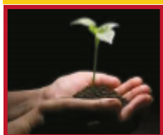
Care for God's Creation Team