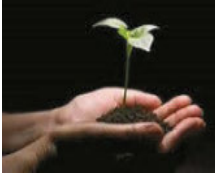
Care for God's Creation Team