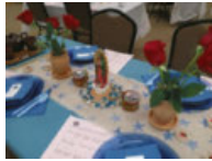
One of the many tables decorated for Candlelight