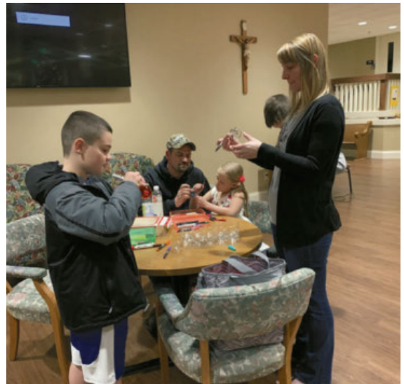
More ornaments for the tree