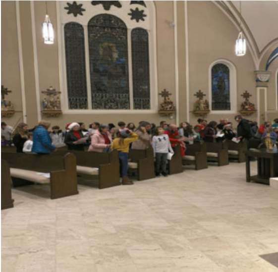
Caroling in Church for the Community