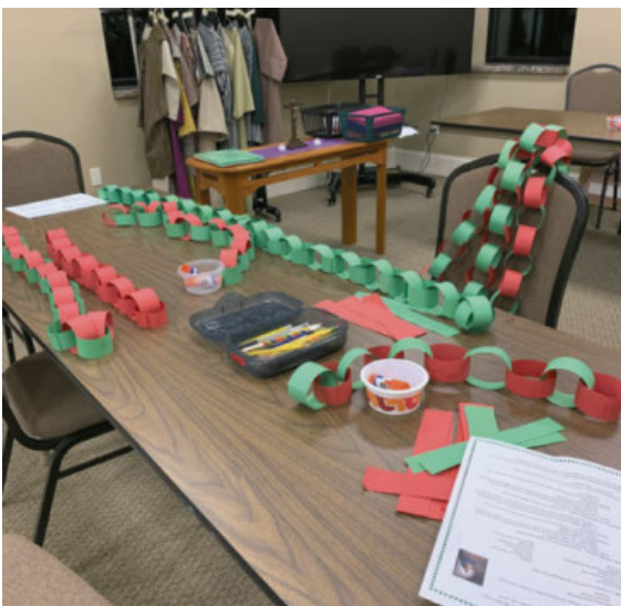
Decorated Chains for Prayer and Thanksgiving