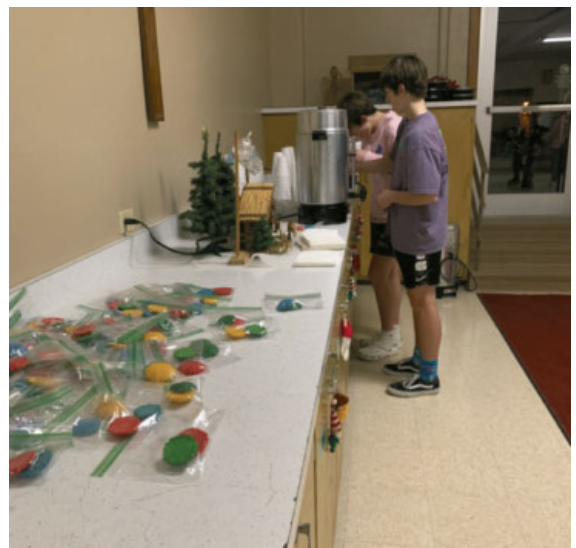
Cookies and Hot Cocoa for Snack