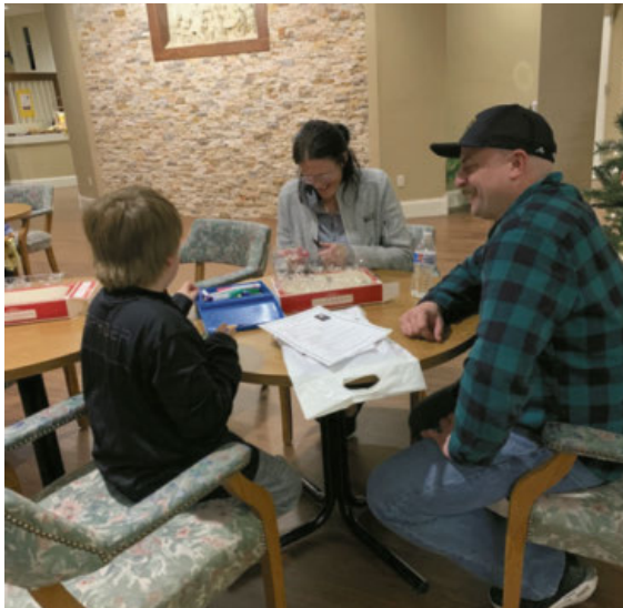
Ornaments for the tree