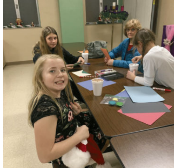
Making Christmas Cards