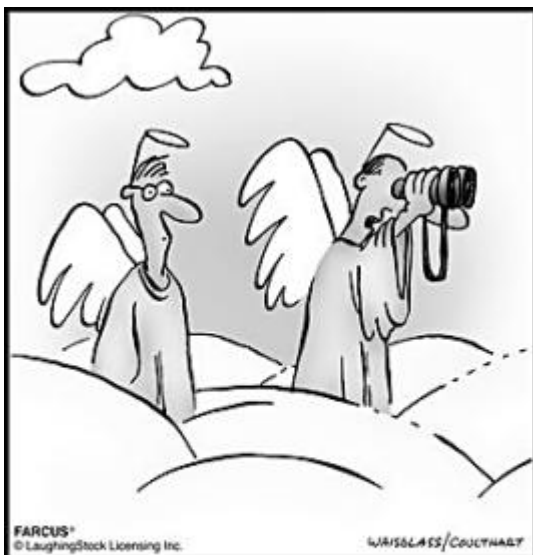
"Man, those guys on Cloud Nine have all the fun."