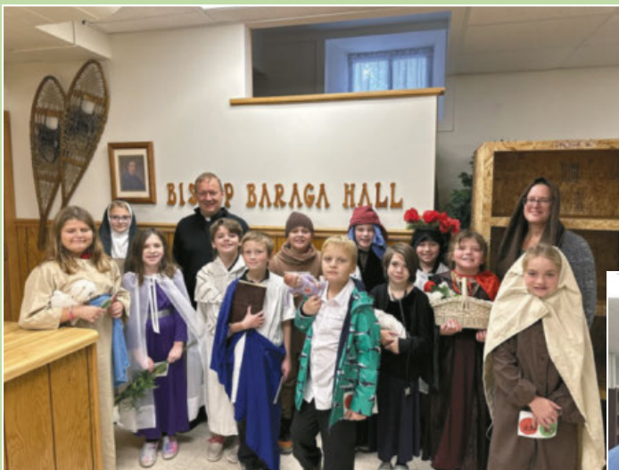
All Saints Day celebrations at Sacred Heart School and Faith Formation