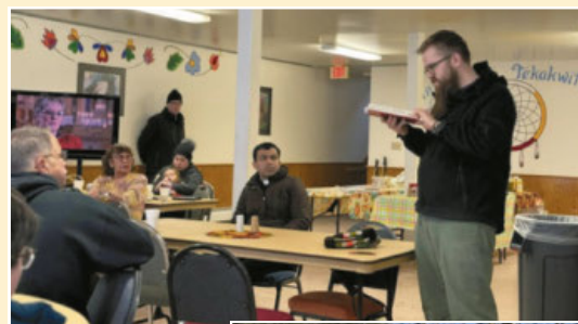
Bishop Baraga Snowshoe Walk at Holy Name and Assinins Cemetery