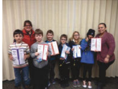
3rd grade RE students have been learning about the Rosary