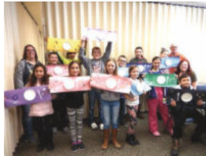
4th, 5th, 6th & 7th grade RE students have been learning about Lent Pray, Fast, Give