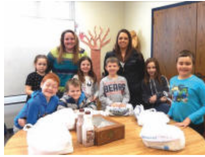
2nd grade RE students spend their class time preparing for First Communion

Hearty soup, cereal, peanut butter, jelly/jams, crackers, puddings, cookies, jello cups, pasta, canned fruits and vegetables, shampoo, feminine products, deodorant, combs, brushes, rakes, shovels, & garden tools.