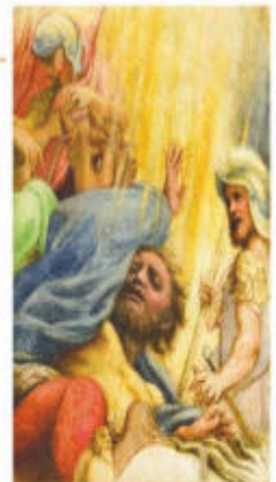
THE CONVERSION OF ST. PAUL THE APOSTLE

"Repent, and believe in the gospel." Some type of honest and sincere repentance is necessary for any type of authentic growth and maturity. We have to come to the realization, unless we are happy wallowing in immaturity and superficiality, that the way we have been doing things is not the best or the healthiest. There isn't a human being alive who hasn't acted foolishly or erratically at the cost of almost losing a treasured relationship. "Why did I act that way?" is a question we often ponder after some reflection and enlightenment. Faith works the same way. Stumbling through life and bumping up against meaninglessness, a person can begin to see that something significant is missing. They see that there is merit to a relationship with God and an embrace of faith. Before these can take root, sincere sorrow for past wrong doing, missed opportunities, errors in judgment, and short sightedness is necessary. Repentance is necessary. Then having realized that we were walking in darkness, we can rejoice that by God's grace we now see the light.