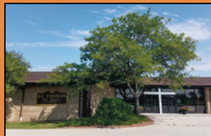
St. Thomas the Apostle