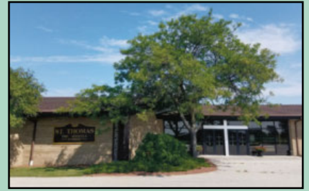
St. Thomas the Apostle