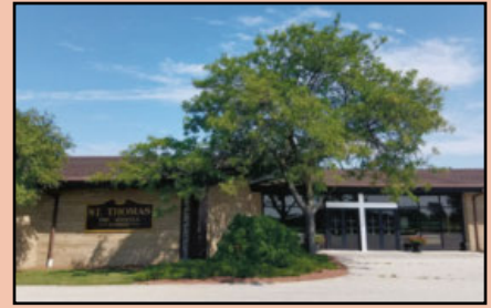
St. Thomas the Apostle