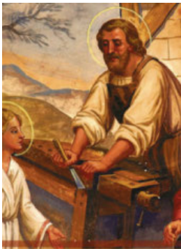
ST. JOSEPH THE WORKER

Because today (Sunday, May 1) is the Third Sunday of Easter, we do not celebrate the feast of St. Joseph the Worker that is usually celebrated on May 1. However, I believe the life of St. Joseph offers us many things to reflect upon and to guide us in these troubled times in which we live.