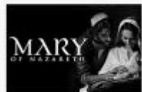
Mary of Nazareth

This film captures the essence of Mary's profound faith and trust in God, amidst the great mysteries that she lived with as the Mother of the Messiah. Prepare for Christ's coming by reflecting on his mother's profound faith and trust.