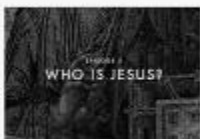
The Search: Who is Jesus?

Through Jesus' humanity, we are invited to know God in a very personal way. But how exactly did this lowly carpenter become the most pivotal figure of all time? Find out in this episode of The Search.