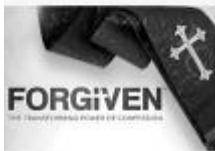
Forgiven: The Transforming Power of Confession

Through Jesus' humanity, we are invited to know God in a very personal way. But how exactly did this lowly carpenter become the most pivotal figure of all time? Find out in this episode of The Search.