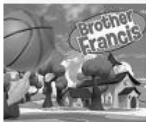
Born into the Kingdom: The Miracle of Baptism

In this happy presentation, Francis invites us to share the realities of the Sacrament of Baptism and the union it pro- vides us with God’s big family!