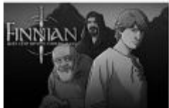
Finnian and the Seven Mountains

In this happy presentation, Francis invites us to share the realities of the Sacrament of Baptism and the union it pro- vides us with God’s big family!