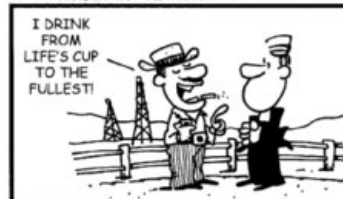
18TH SUNDAY IN ORDINARY TIME