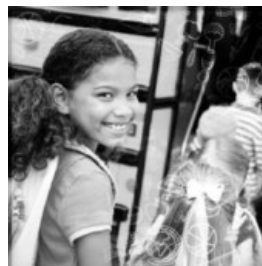
22ND SUNDAY IN ORDINARY TIME

Tuesday, September 6: All School Mass; Staff