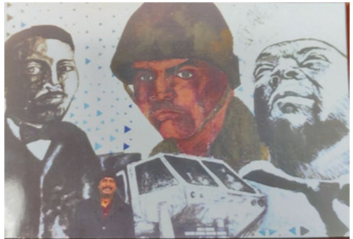
Upper middle: self-portrait displayed as a mural at the WI Veterans Museum in Madison, WI