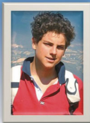
Blessed Carlos Acutis