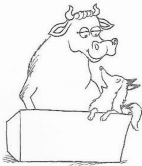
An ox in a box.