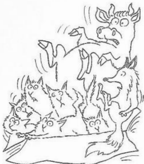
Can you fix it?