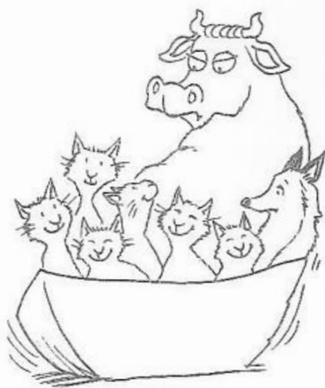
Six cats in a box.