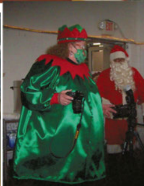
Volunteering at Center Events