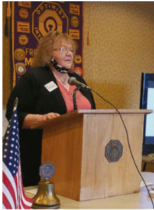
Speaking on behalf of the Center