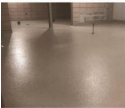
Epoxy flooring in the kitchen area.