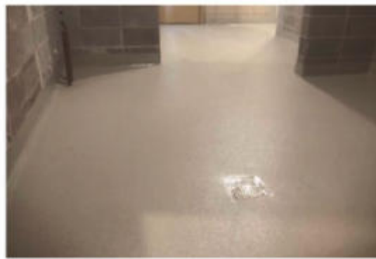
Epoxy flooring in the dishwasher area.