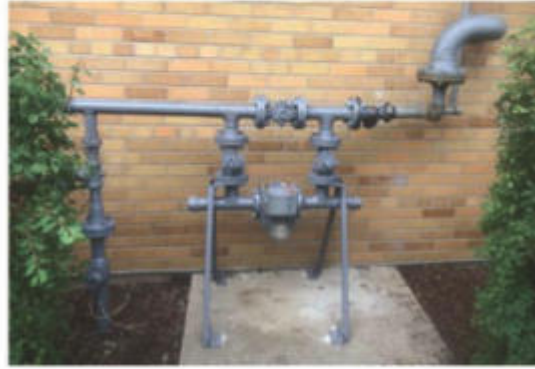
New rotary gas meter.