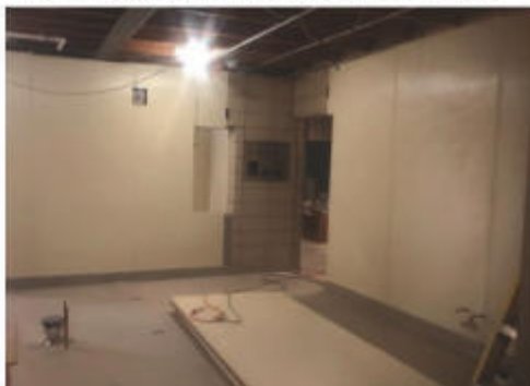
FRP wall panels in the kitchen area.