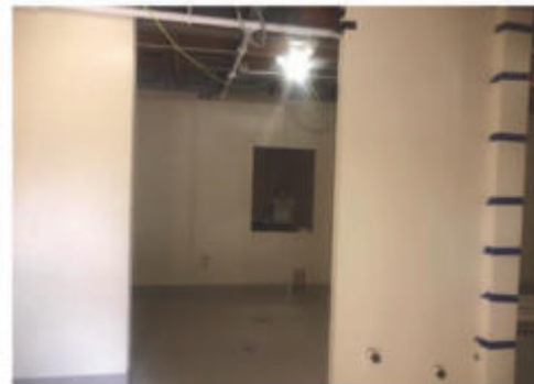
FRP wall panels in dishwasher room.