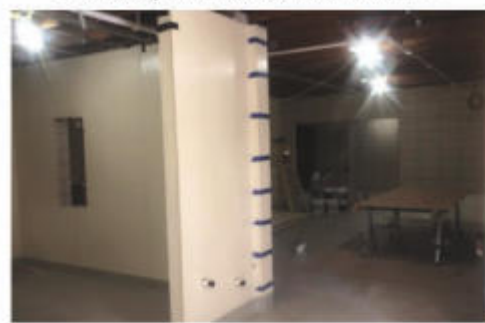
FRP wall panels in kitchen area.