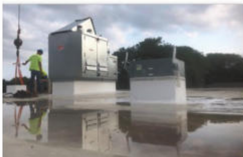
New makeup air unit set on the new curb.