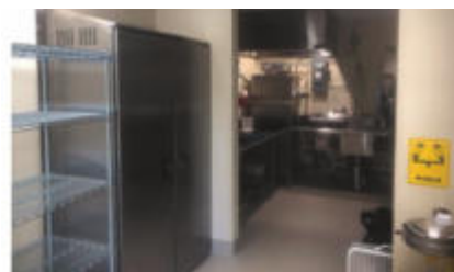
Mop sink cabinet and dishwashing room.