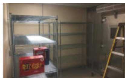
Dry storage shelving and walk-in cooler/freezer.