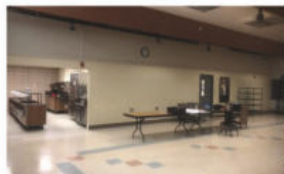
FRP and new paint on kitchen demising wall.