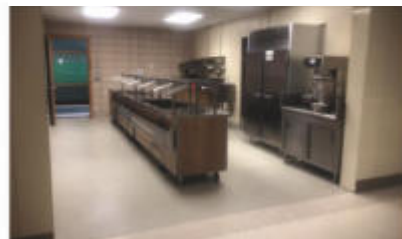
Serving line, coffee maker, and pass-thru refrigerator.