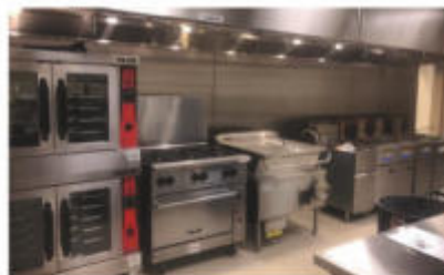
New cook line and exhaust hood.