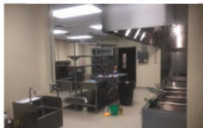
Kitchen prep table