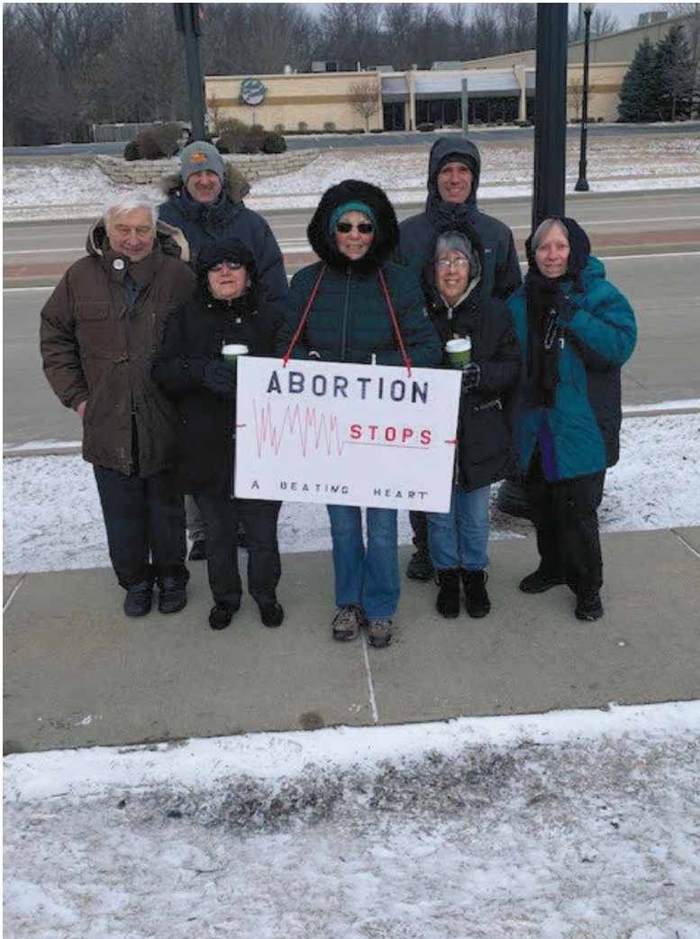
It was a chilly day for the pro-life rally in Green Bay Saturday March 26th. Thank you to all who came and walked and prayed for the babies.