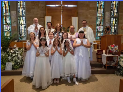
Congratulations and welcome to the Table of the Lord First Holy Communion 4/26/26