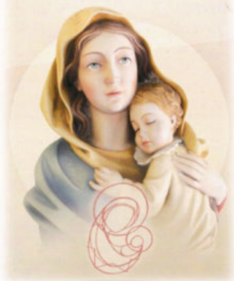
THE SOLEMNITY OF MARY, THE HOLY MOTHER OF GOD

If you haven't returned to Mass yet, decide to return in the New Year! We've missed having you in the church and in our pews.