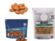
Nuts: Almonds, Walnuts, Pecans