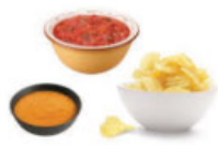
Salsa or Queso Large Chips