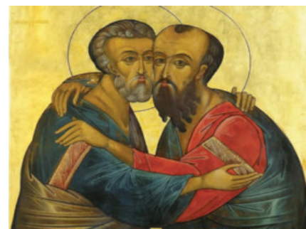
STS. PETER & PAUL, APOSTLES

Welcome! If you're new to our parish, call the office and register with us. We're happy you're here! ¡Bienvenido! Si es nuevo en nuestra parroquia, llame a la oficina. ¡Estamos felices de que estén aquí!