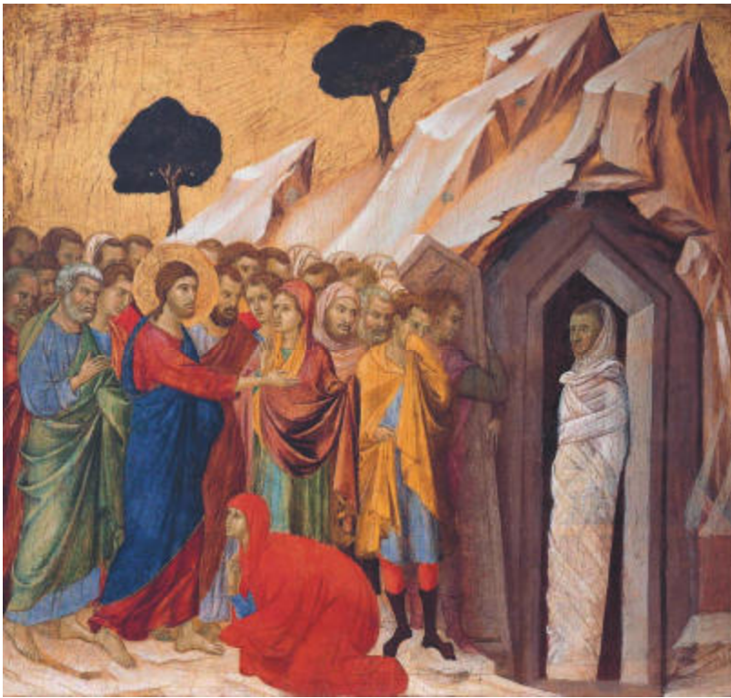
The Raising of Lazarus, by Duccio di Buoninsegna, 1310–11

The Gospel reading of the Raising of Lazarus from the Dead that we hear this weekend during our 10:30am Mass comes from John, chapter 11, verses 1-44. Lazarus dies and is buried, and four days later Jesus brings Lazarus back to life. Lazarus lives in Bethany with his sisters, Martha and Mary, and is not the same person in Jesus' parable in Luke 16:19-31 which tells of a poor man named Lazarus who is ignored as he sits at a rich man's doorstep.