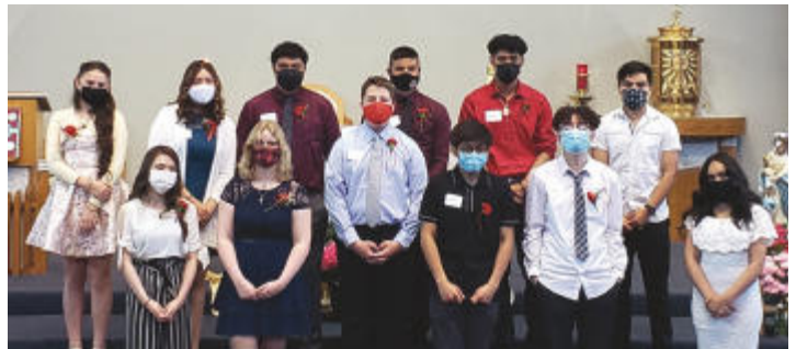
Congratulations to the Confirmation class of 2020-21! May the Holy Spirit strengthen our newly confirmed for their lifelong faith journey.

Go out and witness (faith) to your neighbors, your family, your workplace.