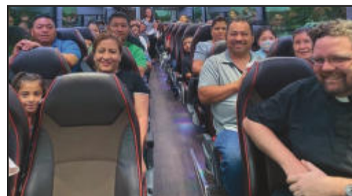
Los feligreses de Asunción disfrutaron la comunión en el Santuario de Nuestra Señora de Guadalupe el 24 de julio.