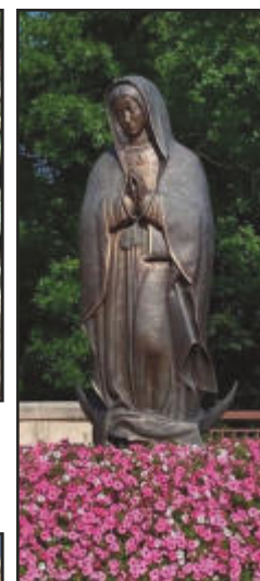
Assumption Parishioners enjoy fellowship at the Shrine of Our Lady of Guadalupe on Saturday, July 24.