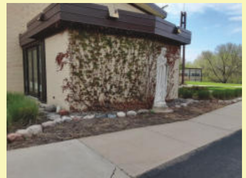
The East Entrance Garden, Statue of Mary

St. Mary of the Lake Generosity May 2, 2021 $ 6,266.00 Online Giving Weekly Envelopes $ 10,178.00 Thank you for your generosity!