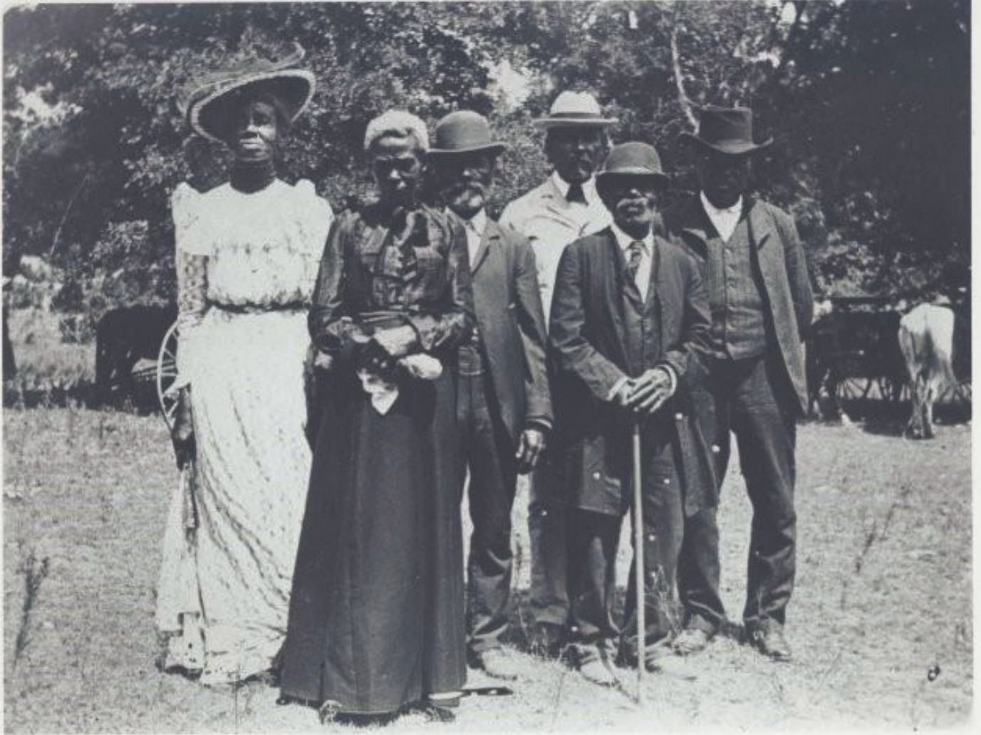
Juneteenth Emancipation Day, June 19, 1900, Texas

Juneteenth, which is celebrated on June 19, commemorates the day that Union soldiers in 1865 told the 250,000 enslaved people in Texas - the last remaining enslaved African Americans in the Confederacy - that the Civil War had ended and they were free. This was over two years after the formal issuance of the Emancipation Proclamation. The holiday has become a time to reflect on the racial injustice and trauma our country has experienced the last 400 years.