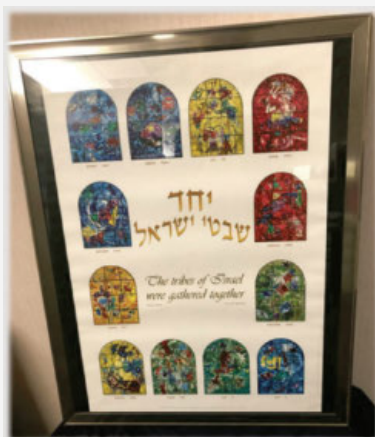
Artist: Marc Chagall Tribes of Israel , print metal frame, 24"x30"