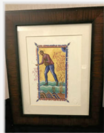
Artist: St. John's Bible Sower of the Word , lithograph embossed, wood frame, 14.5"x18"