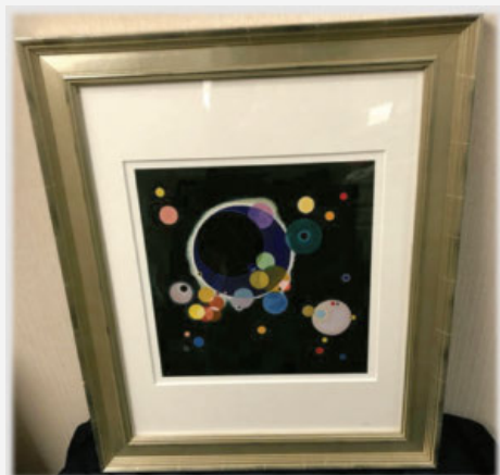
Artist: Vasily Kandinsky Several Circles , lithograph gilded wood frame, 19.5"x24.5"