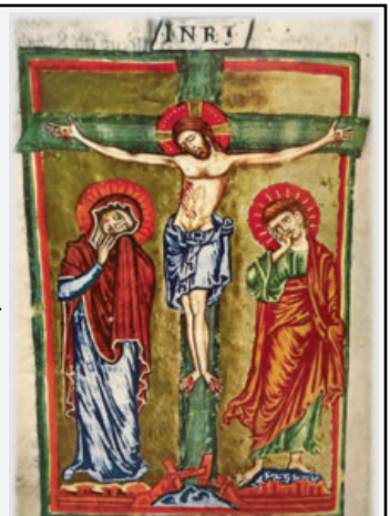
Icon: Kreuzigung/Crucifixion Kunstverlag Maria Laach, Germany, size: 9"x12"