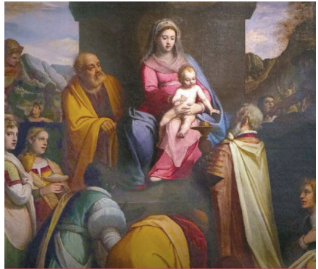
THE EPIPHANY OF THE LORD

Website: www.churchofsttimothy.org Twitter: @SaintTimothys