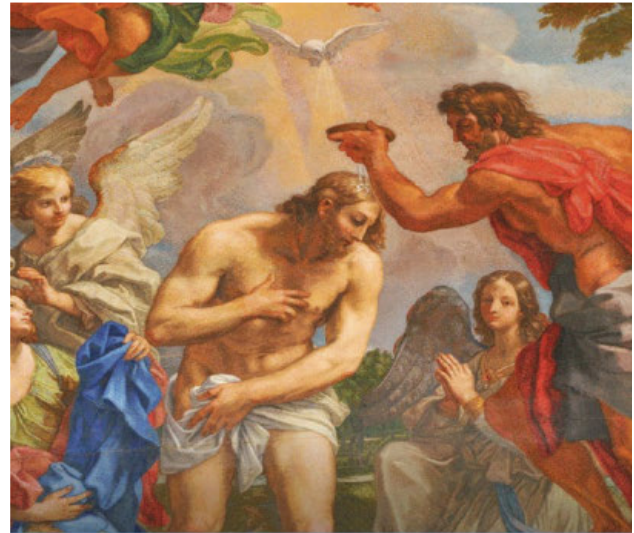
THE BAPTISM OF THE LORD

Website: www.churchofsttimothy.org Twitter: @SaintTimothys