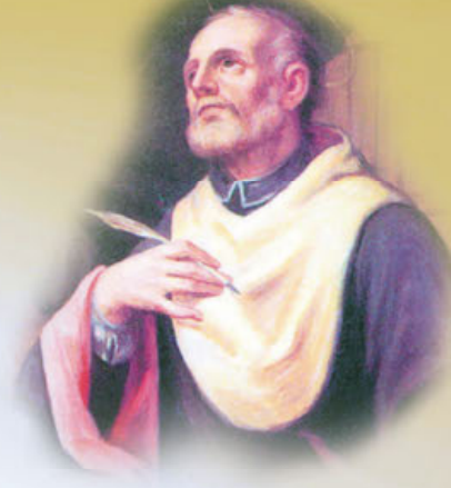
St. John Cantius Church