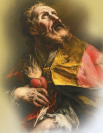
Church of St. Augustine