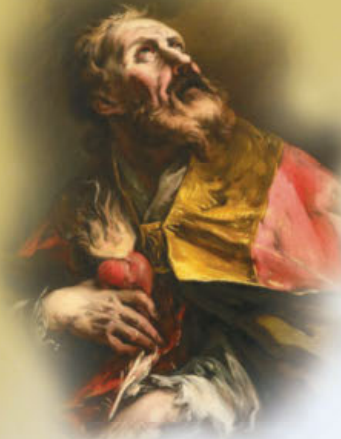
Church of St. Augustine