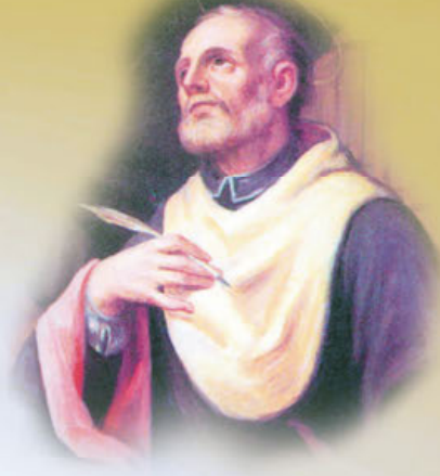
St. John Cantius Church