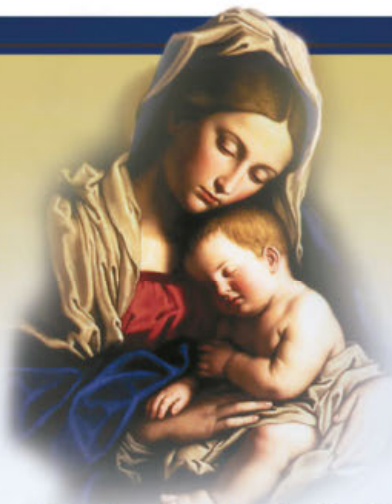
St. Mary's Cathedral