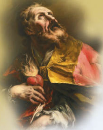
Church of St. Augustine