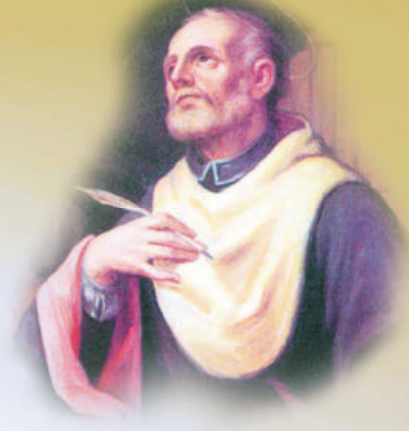
St. John Cantius Church