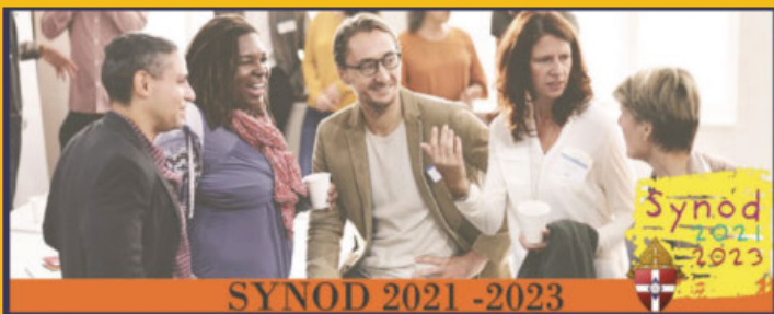
SYNOD 2021 -2023

Pope Francis has called for a Synod in 2023. He has asked his Bishops and the people of their Diocese to come together to discern where the Holy Spirit wishes to lead the Church in the third millennium. In order to do this, the Bishops have asked each parish to set up synod listening sessions to discern and answer some fundamental questions. Pax Christi will hold their synodal listening session on Sunday February 6. Everyone is welcome. The feedback from this listening session will be compiled and sent to our bishop at the end of February 2022 .