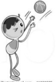
illustrations of.com #1230935

St. Pat's Knights of Columbus Council #14481 sponsored a Free Throw Contest last Sunday at 1:30pm in the gym! THANKS to all the youth age 9-14 years who participated!