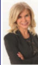
Parishioner Annunciation Parent