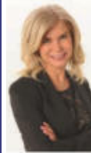
Parishioner Annunciation Parent