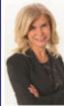
Parishioner Annunciation Parent

Proud to DONATE % of my commission on each sale in your name to Annunciation Church!