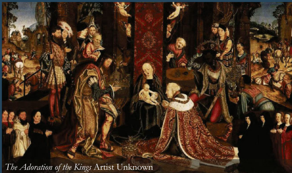
The Adoration of the Kings Artist Unknown