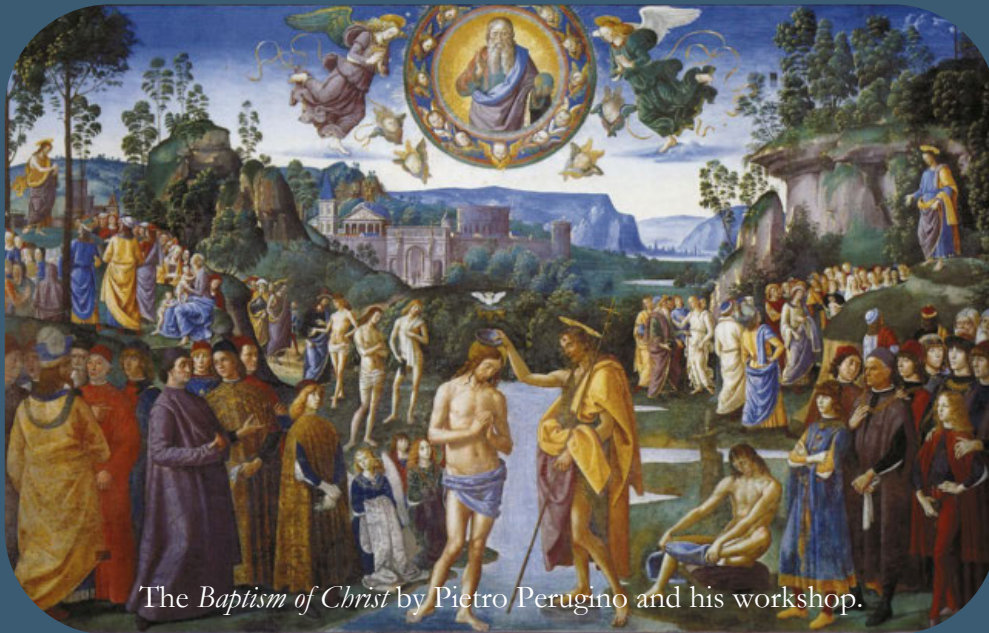
The Baptism of Christ by Pietro Perugino and his workshop.