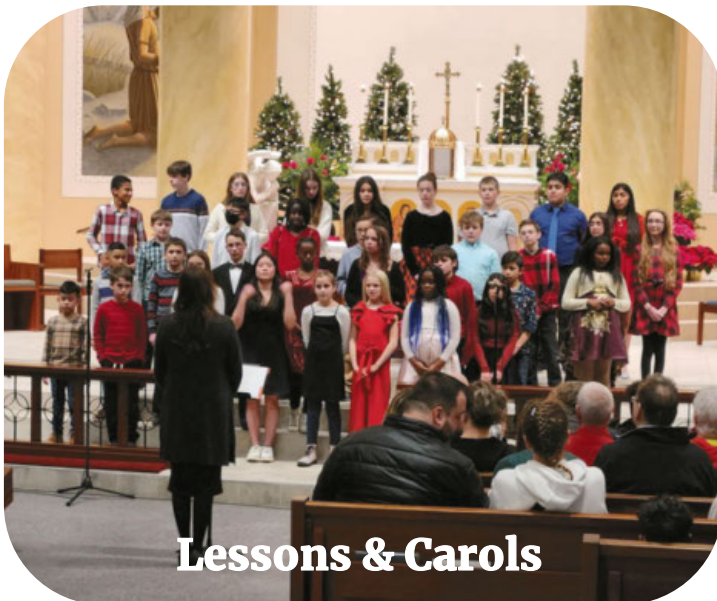
Lessons & Carols