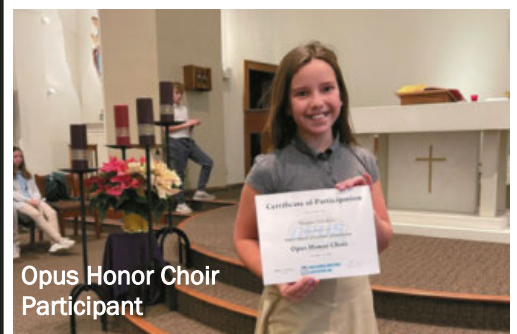
Opus Honor Choir Participant