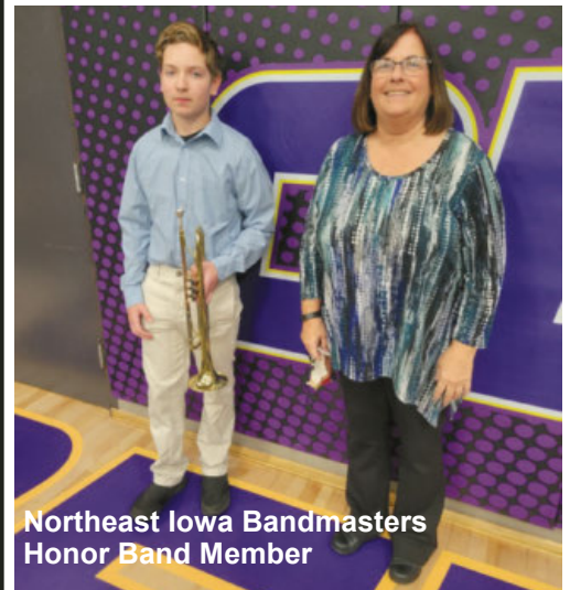
Northeast Iowa Bandmasters Honor Band Member